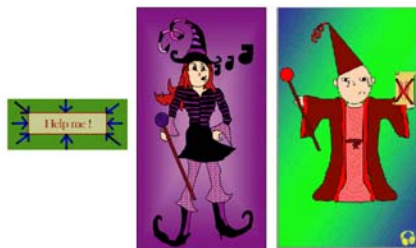
Figure 1: 3 help system representations

The architecture of the software will enable investigations on the impacts of using emotive interface personas as helpers. The DividingQuest includes 3 representations of the child user-interface, to be differentiated in their representation of help system (by buttons, by an interface persona giving verbal praise and rewards, or by an interface persona with the characteristics of the second interface but also displaying some emotions).